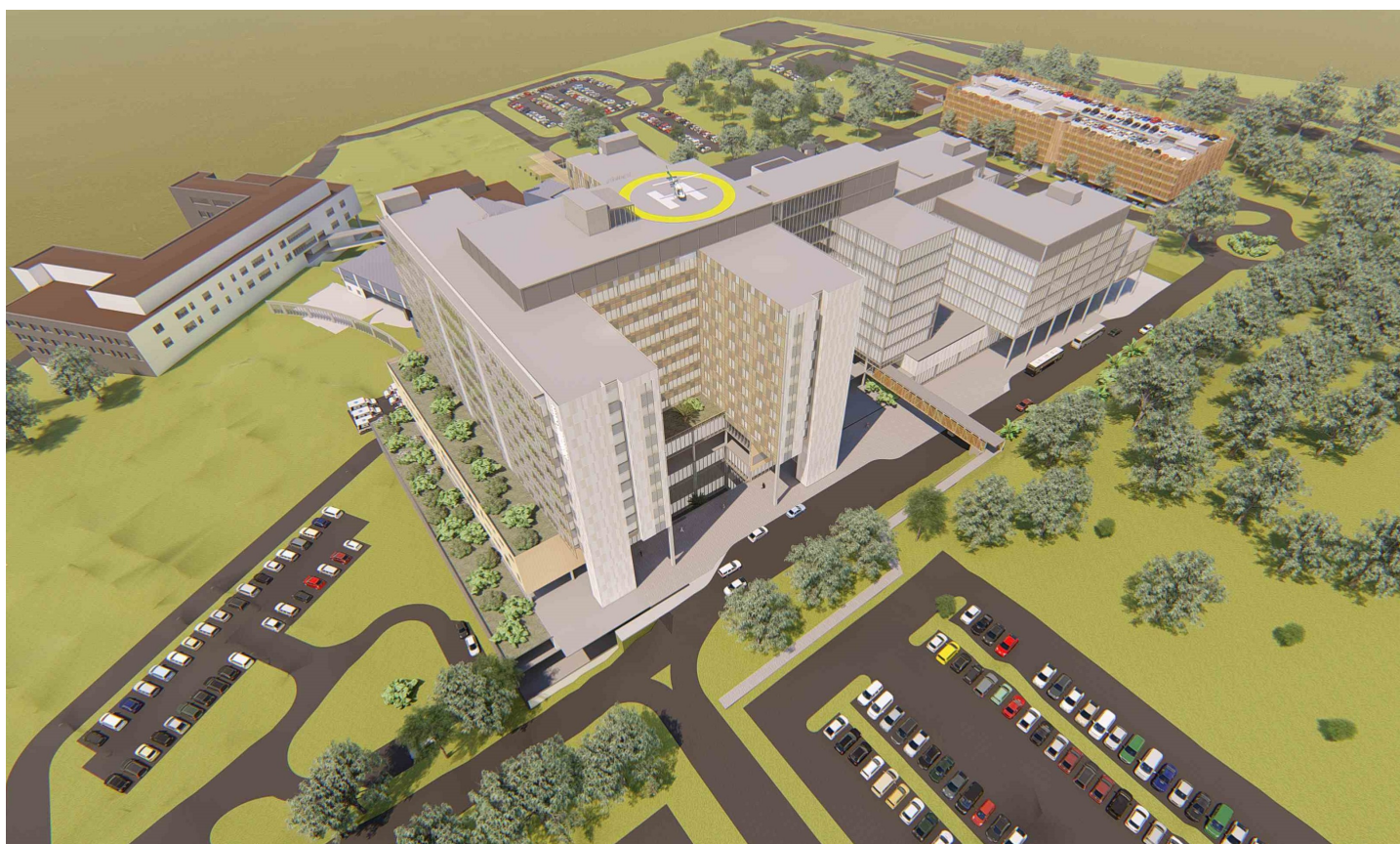
Artist impression of the site