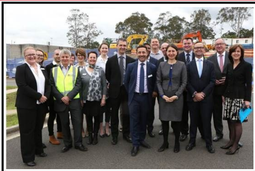
To access the Campbelltown Hospital Redevelopment fly-through of the project click here

Campbelltown Hospital has marked another milestone in its $632 million stage two redevelopment with schematic design for the project launched in October. NSW Premier Gladys Berejiklian officially launched the schematic design, together with the Minister for Health and Medical Research Hon Brad Hazzard, on Monday 29 October 2018 at the site of the new multi storey car park. The completion of the schematic design is a key step in delivering the hospital redevelopment which will provide a new purpose built facility offering world-class services for the Macarthur Community.