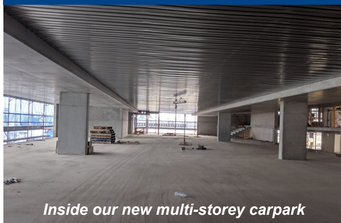
Inside our new multi-storey carpark

Next Pop-Up Information Stall Campbelltown Mall - Friday 31 May 11am to 2pm outside Woolworths