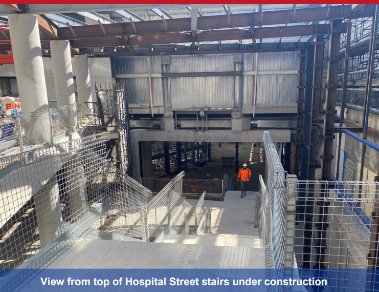
View from top of Hospital Street stairs under construction