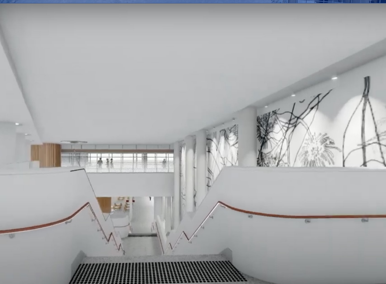
Artist impression of future view from top of Hospital Street