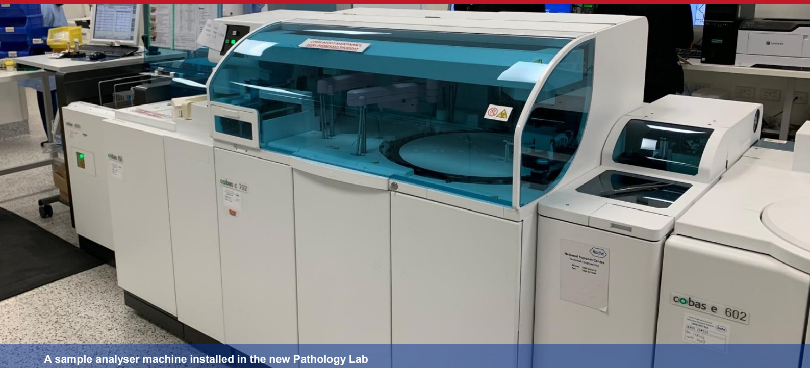
A sample analyser machine installed in the new Pathology Lab