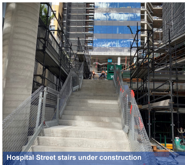
Hospital Street stairs under construction