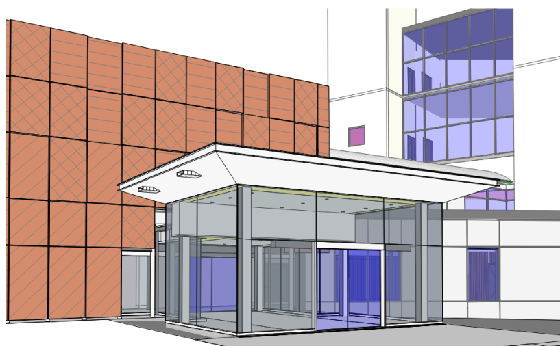
Artist impression of the new, northern entrance to Campbelltown Hospital

Works to remove the hospital's old building C are set to start in late May.