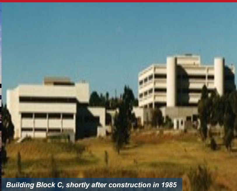
Building Block C, shortly after construction in 1985