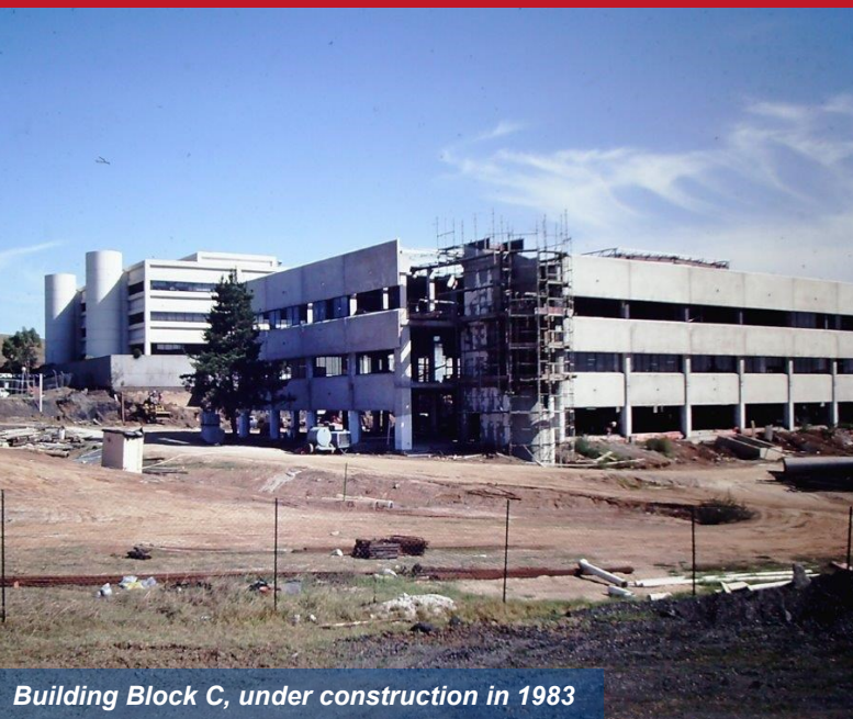
Building Block C, under construction in 1983