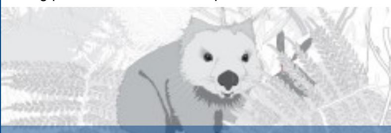
Example of artist Erica Seccombe's native animal designs

Similar to a game of hide and seek, children will be able to spot common wombats, sugar glider possums, blue tiger butterflies and more. Brightening the space, the playful illustrations will provide comfort, delight and interest to patients and families, many of whom spend long periods of time in the hospital.