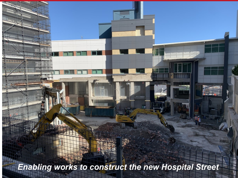
Enabling works to construct the new Hospital Street

More than 3030 doors will be installed within the new Clinical Services Building, including 2020 single doors and 1010 double doors!