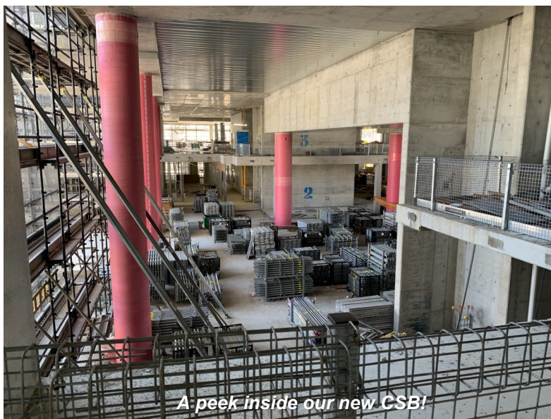
A peek inside our new CSB!