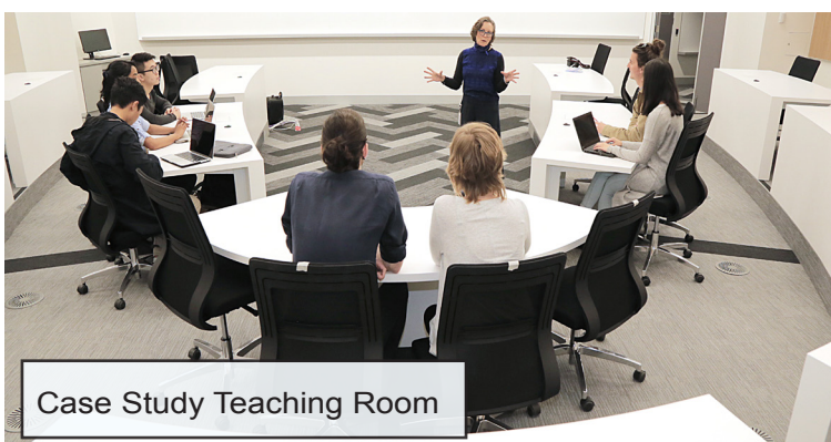
Case Study Teaching Room