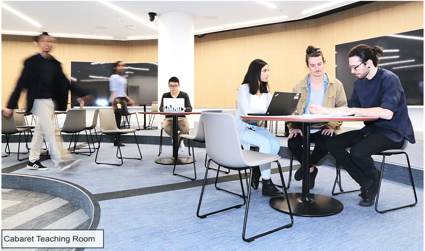
Cabaret Teaching Room

The Westmead Education and Conference Centre (WECC) level 1 is being upgraded by the University of Sydney as part of the Westmead Redevelopment refurbishment program. It will open in September 2017 for students and staff participating in education, training and research activities.