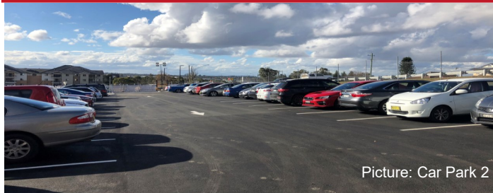
Picture: Car Park 2

We are pleased to announce that car parks 2 and 3 (located adjacent to Appin Road, behind Waratah House) are now complete and ready for occupation. The opening of these car parks enables other works to commence across the campus, such as the new multi-storey car park location.