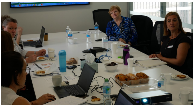
Picture: Schematic Design finalisation