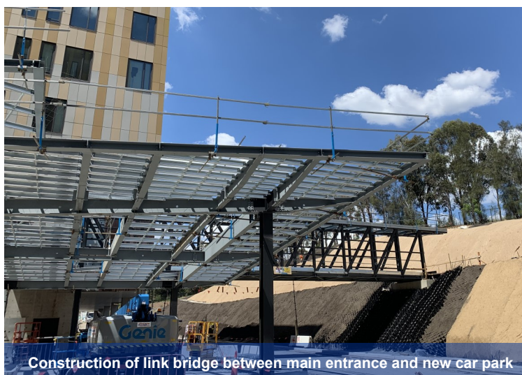
Construction of link bridge between main entrance and new car park