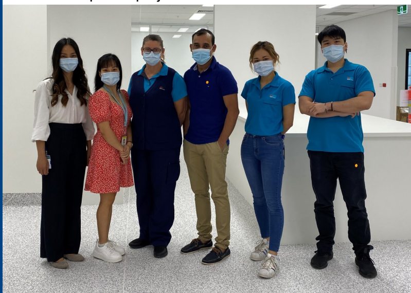
The Pathology Team checking out their brand new space