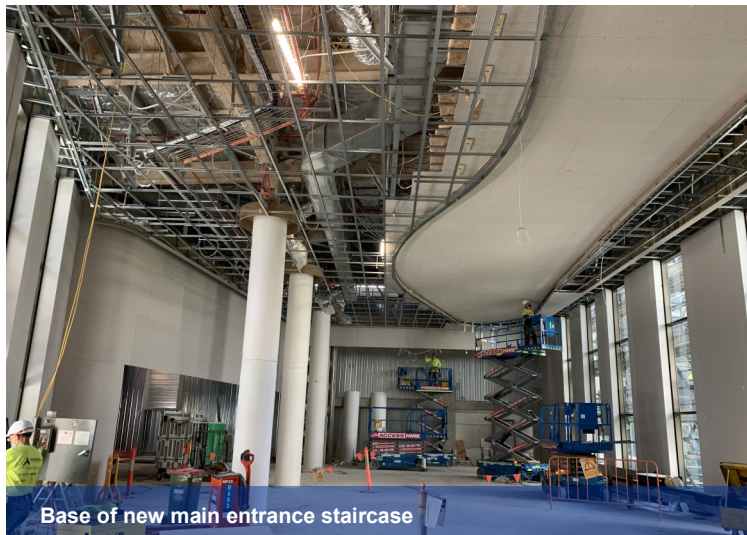
Base of new main entrance staircase